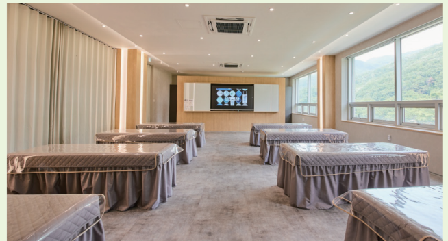
Beauty Care Major Skin Care Practice Room