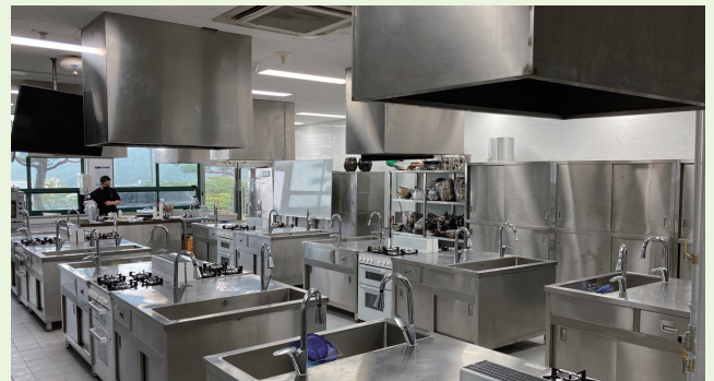
Hotel Cooking and Baking Major Cooking practice room