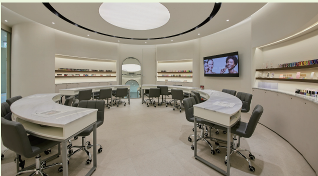
Beauty Care Major Nail Practice Room