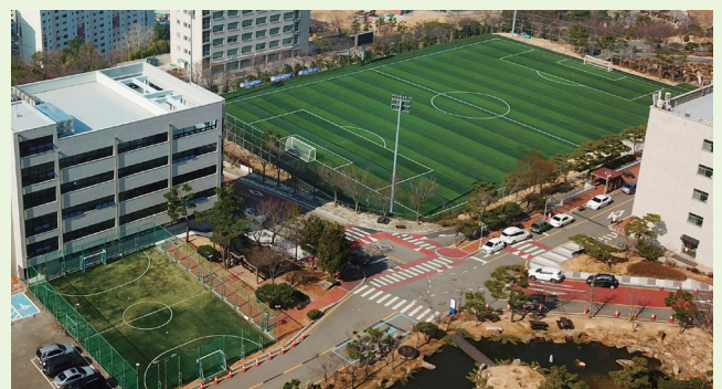
Soccer field and futsal field