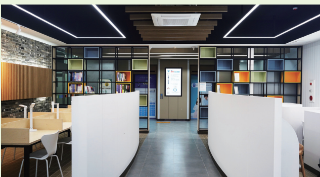
Building A Creative Hall - Central Study Cafe